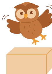
..... above .....