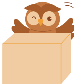
..... behind .....