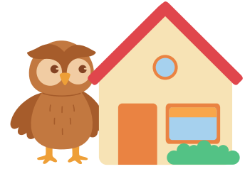
..... at home .....