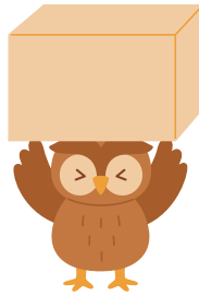
..... under .....