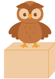
..... on .....