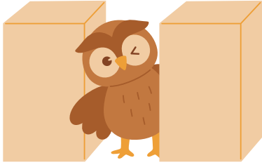
..... between .....

in between at school on near in front of under behind at home at the pool at the zoo above