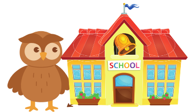
..... at school .....