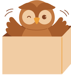
..... in .....