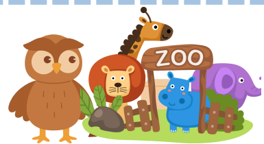
..... at the zoo .....