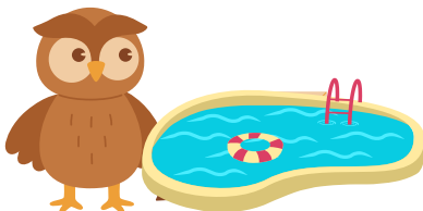
..... at the pool .....